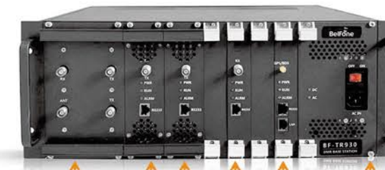
CDU TRU RCU BSCU PSU

CDU: Combiner & Duplex Unit TRU: Transmitter Unit RCU: Receiver Unit BSCU: Base station Controller Unit PSU: Power Supply Unit